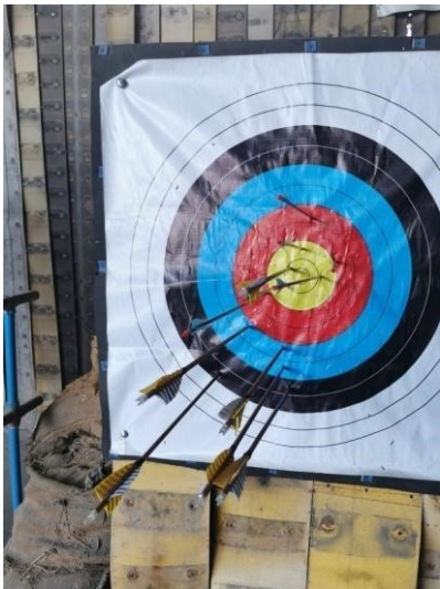
CAPTION: 1A Blue Vanes, 1B White Yellow Feathers R1 E1