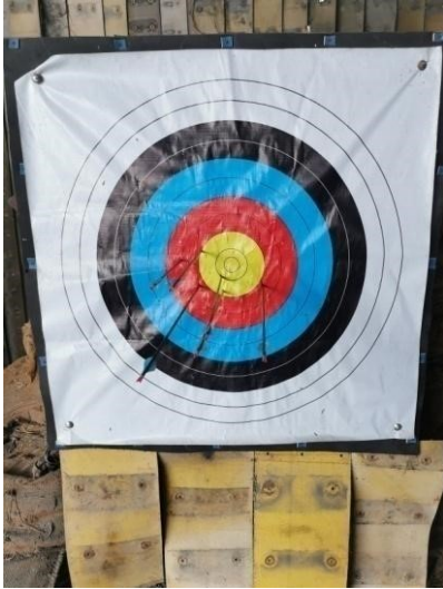
CAPTION: 1A R1 E1