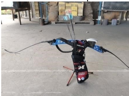
CAPTION: 1A Equipment Check